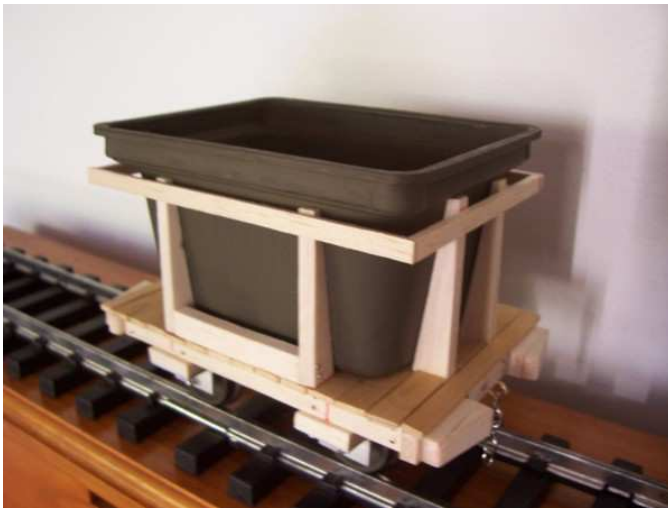
Chain & Hook couplings.