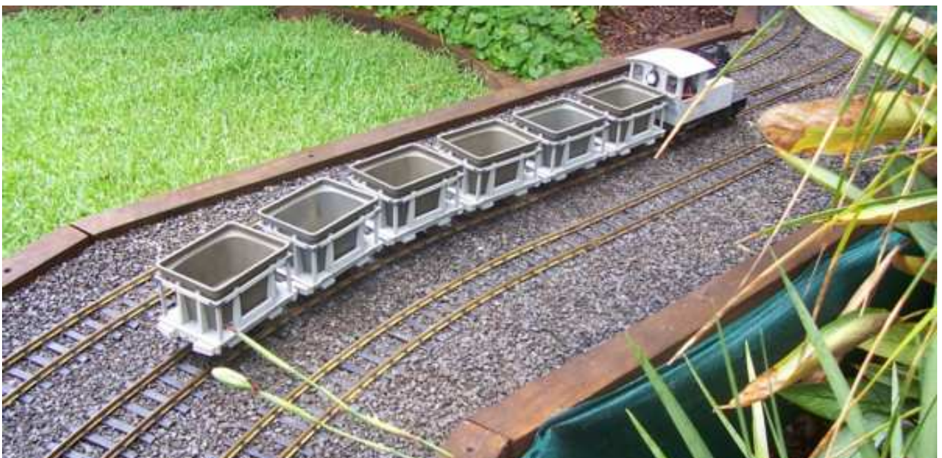
Train with modified Stainz Loco and six Barron River Quarry skips.